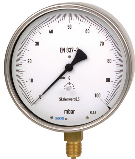
Capsule Pressure Gauge Model 610.20